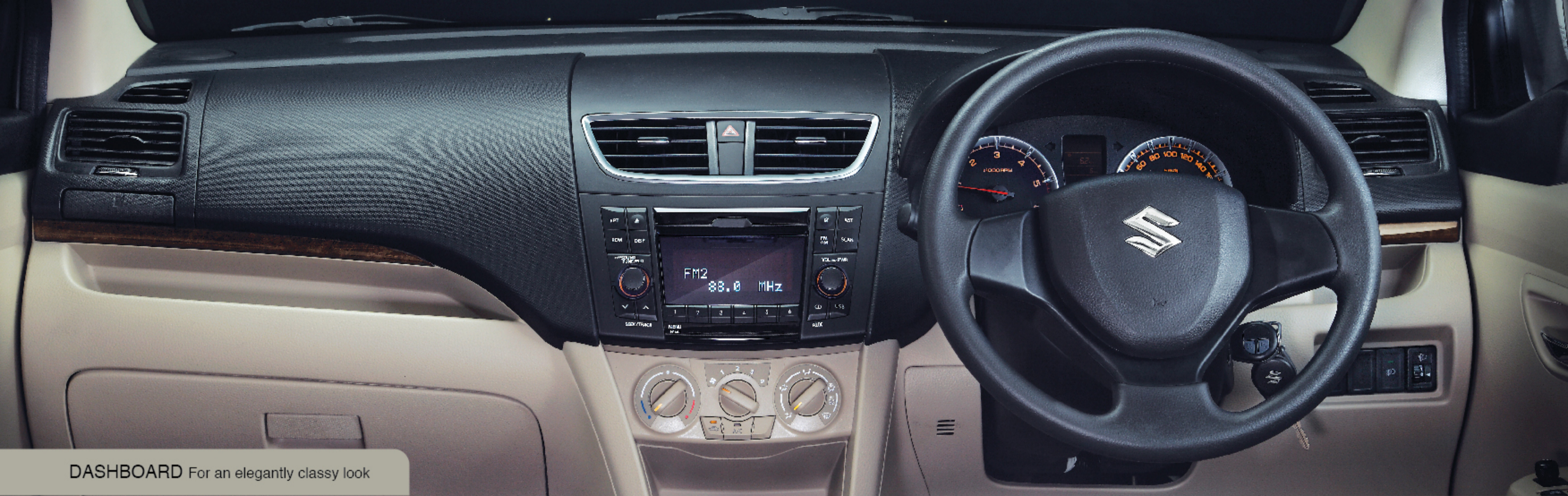
DASHBOARD For an elegantly classy look