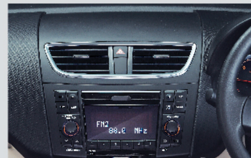
MUSIC CONSOLE That lets you groove to your own tunes

Style that speaks for itself, the new Ertiga Limited Edition is a blend of looks, performance and class that comes together in a host of exciting features. Equipped with a sleek chrome grille that adds panache, plush interiors tailored to perfection, aesthetically designed spoilers, classy body graphics and Decals, the stylish new Ertiga Limited Edition is not just a family car, it's a style statement.