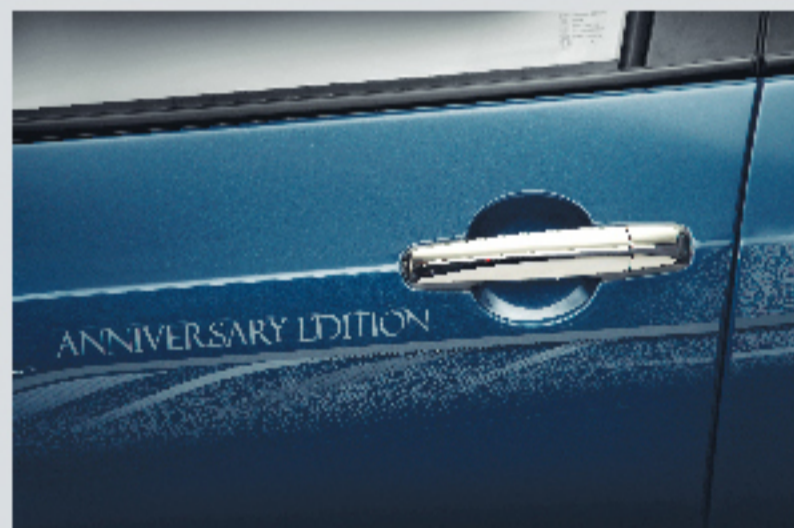
CHROME HANDLE For a sleek and stylish look