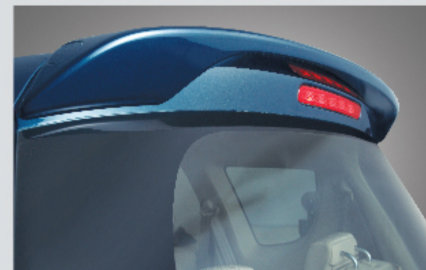
REAR SPOILER For an edgy look and stable handling