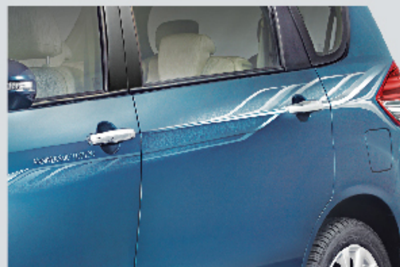
BODY GRAPHICS Designed to match your attitude