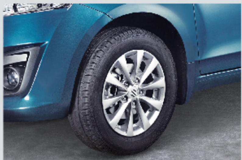
ALLOY WHEELS For smooth handling