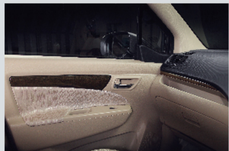
DOOR TRIM For a luxurious feel