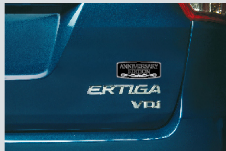
DECALS That match your stylish attitude