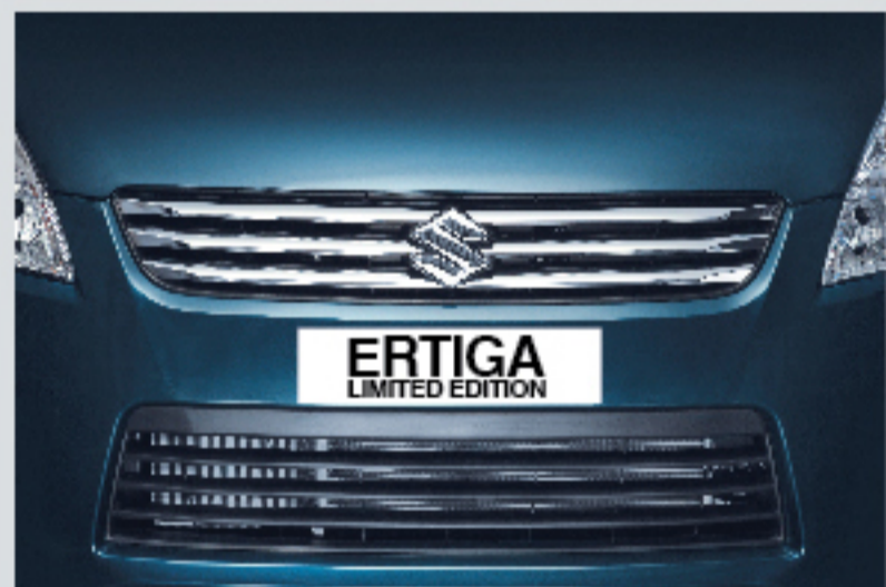
CHROME GRILLE That reflects your style