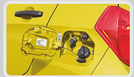
Fuel Inlet with Micro Switch for safety