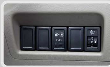
Easy Changeover Switch