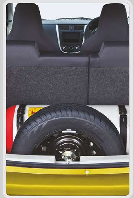
Easily accessible spare tyre