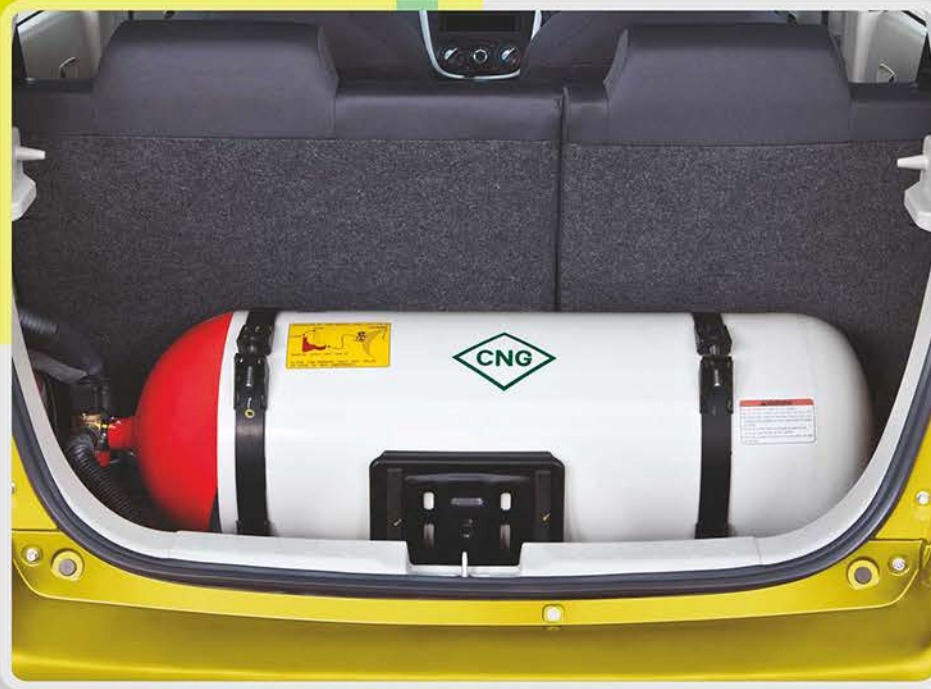
Factory fitted i-GPI CNG Technology