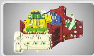
i-GPI Technology for a Smooth Running Engine