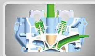
Special Material Used In Engine Parts