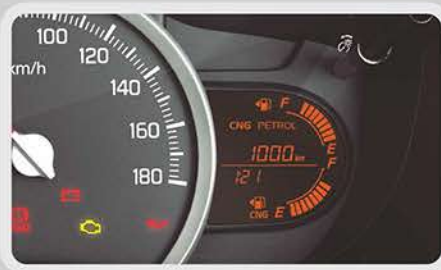
Integrated display showing fuel mode and fuel level