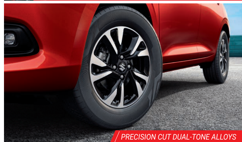
/ PRECISION CUT DUAL-TONE ALLOYS