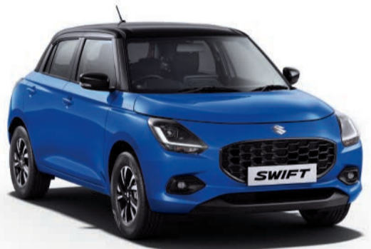
/ Luster Blue with Midnight Black Roof