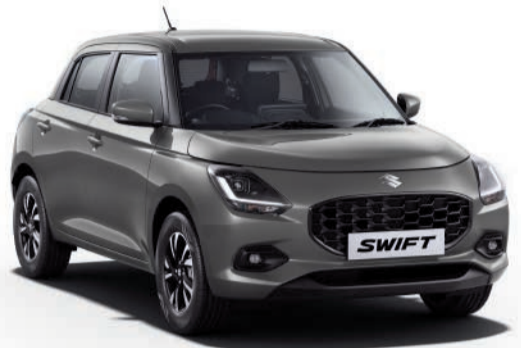
/ Magma Grey