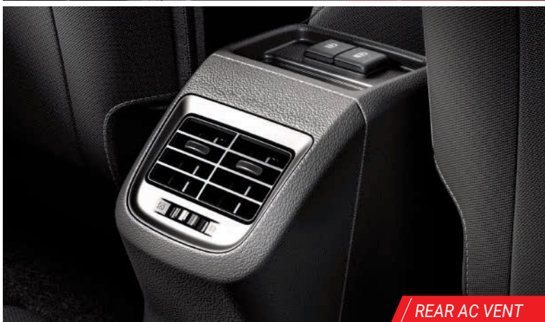
REAR AC VENT