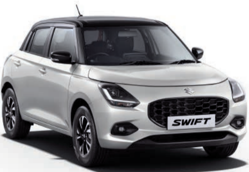
/ Pearl Arctic White with Midnight Black Roof