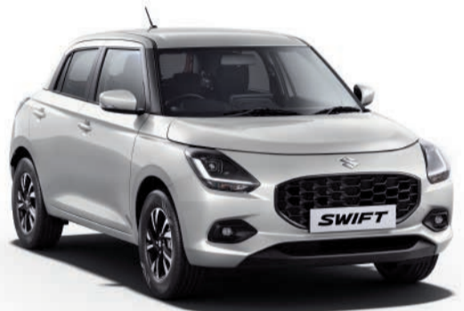
/ Pearl Arctic White