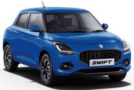
/ Luster Blue 11