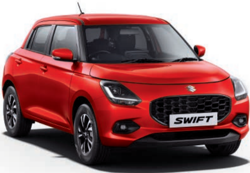
/ Sizzling Red 11