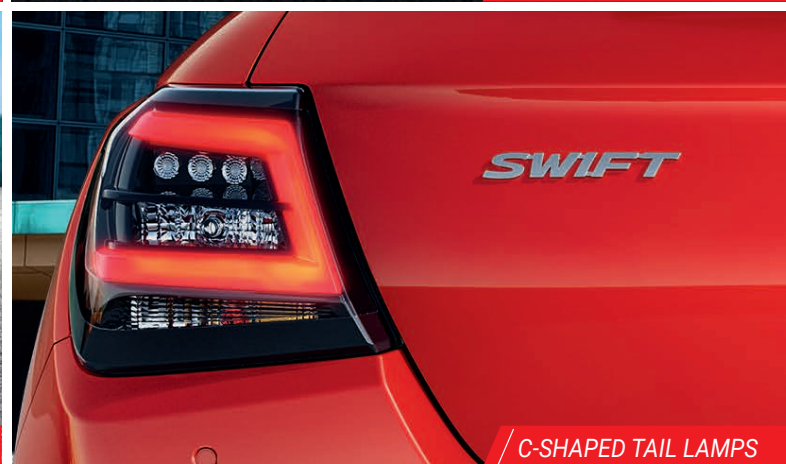
/ C-SHAPED TAIL LAMPS