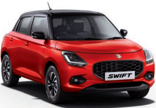
/ Sizzling Red with Midnight Black Roof