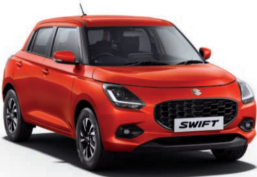
/ Novel Orange