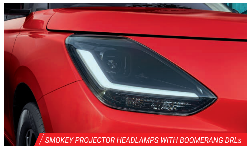
/ SMOKEY PROJECTOR HEADLAMPS WITH BOOMERANG DRLs

With its bold stance and sporty design, the Epic New Swift is quite the looker. It is pure passion crafted into an expression of thrill. As it approaches, heartbeats go up, and you know it is something special.