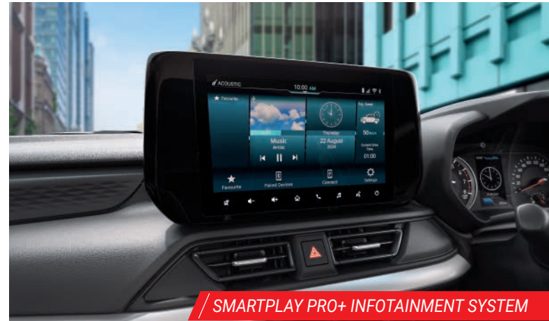
SMARTPLAY PRO+ INFOTAINMENT SYSTEM

No words can describe what you'll feel when you enter the Epic New Swift. But we'll try. This car is designed with ample space keeping your comfort in mind and its Sporty All-Black Interiors make every drive truly stylish. The real head-turner is the sleek and futuristic center console, with a driver-oriented cockpit for easy access.