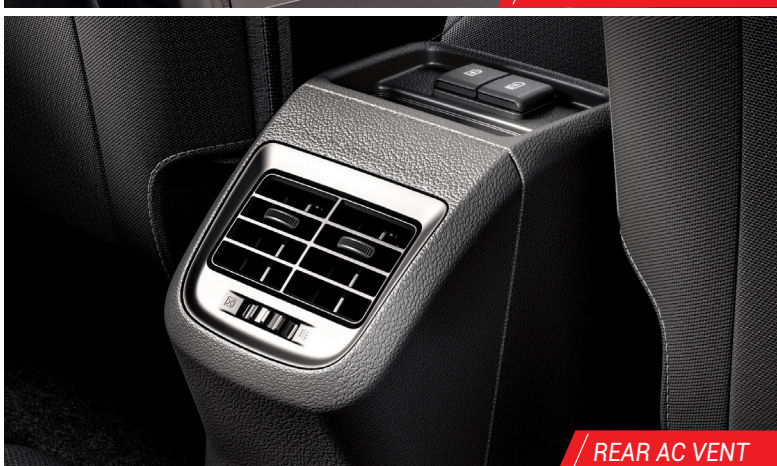
REAR AC VENT