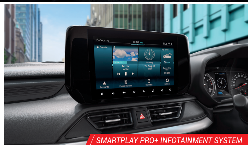
SMARTPLAY PRO+ INFOTAINMENT SYSTEM

No words can describe what you'll feel when you enter the Epic Swift. But we'll try. This car is designed with ample space keeping your comfort in mind and its Sporty All-Black Interiors make every drive truly stylish. The real head-turner is the sleek and futuristic center console, with a driver-oriented cockpit for easy access.