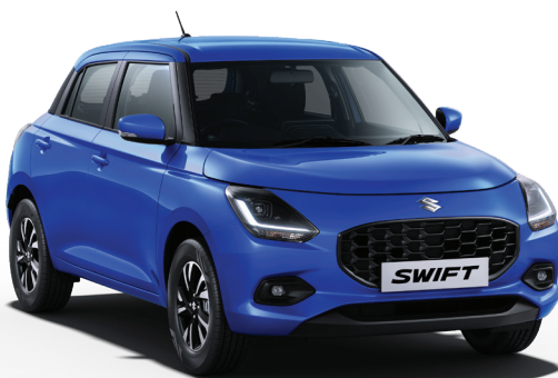
Luster Blue 11