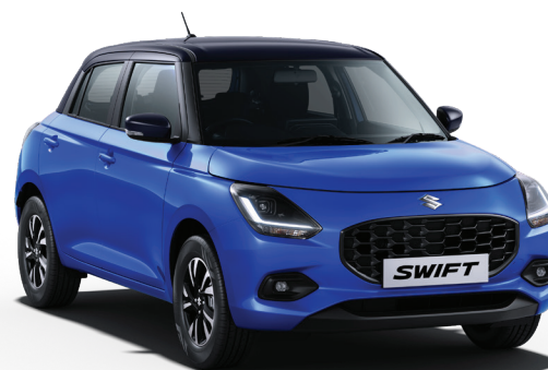
Luster Blue with Bluish Black Roof