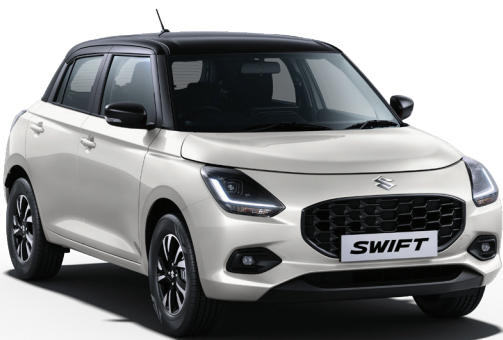
Pearl Arctic White with Bluish Black Roof