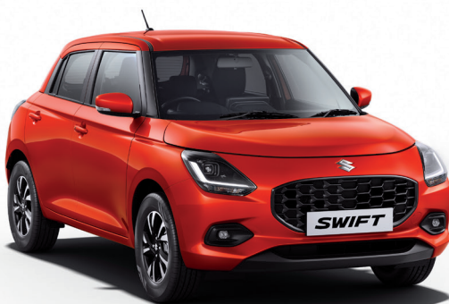
Novel Orange 11