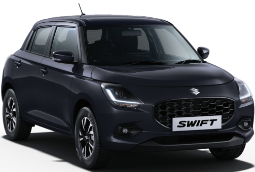
Bluish Black 11