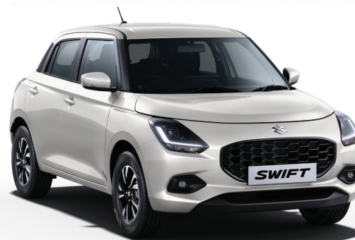
Pearl Arctic White