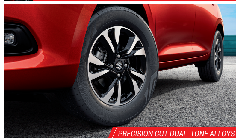
/ PRECISION CUT DUAL-TONE ALLOYS