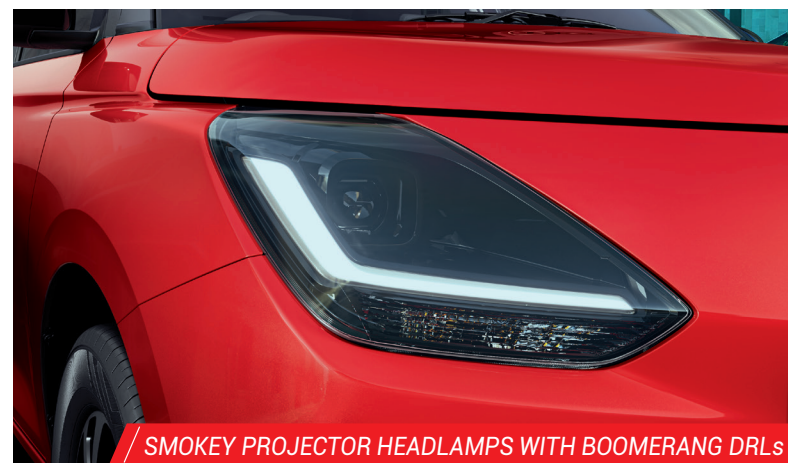
/ SMOKEY PROJECTOR HEADLAMPS WITH BOOMERANG DRLS

With its bold stance and sporty design, the Epic Swift is quite the looker. It is pure passion crafted into an expression of thrill. As it approaches, heartbeats go up, and you know it is something special.