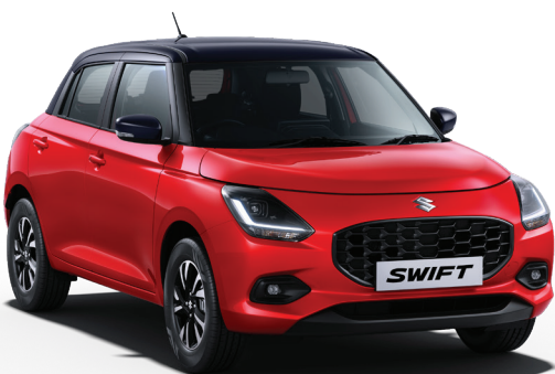
Sizzling Red with Bluish Black Roof