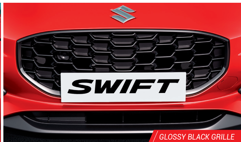
/ GLOSSY BLACK GRILLE