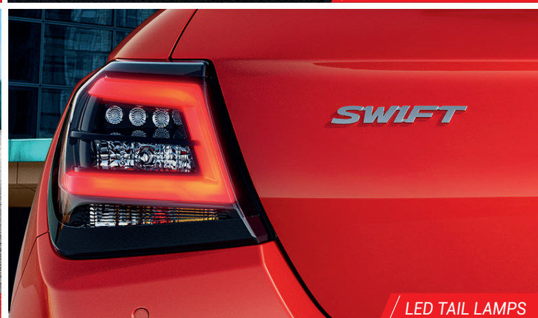
/ LED TAIL LAMPS