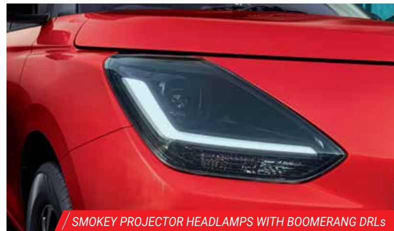
/ SMOKEY PROJECTOR HEADLAMPS WITH BOOMERANG DRLs

With its bold stance and sporty design, the Epic New Swift is quite the looker. It is pure passion crafted into an expression of thrill. As it approaches, heartbeats go up, and you know it is something special.