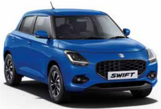
/ Luster Blue 11