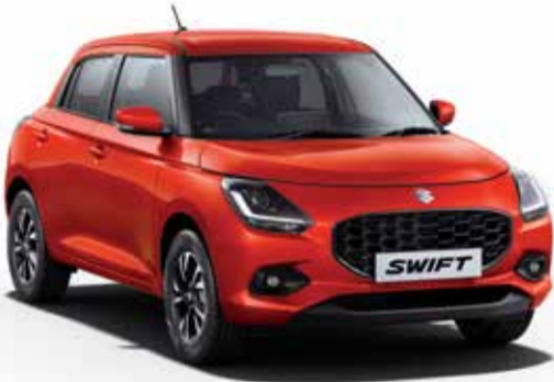
/ Novel Orange