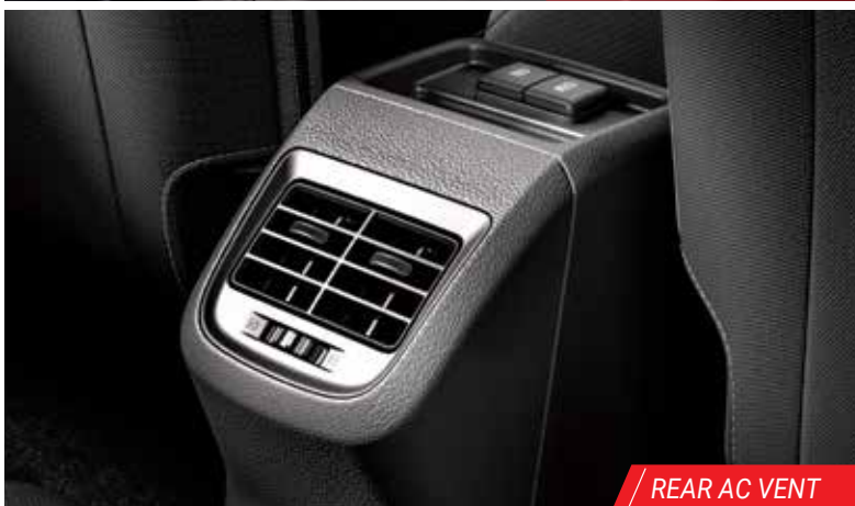
REAR AC VENT