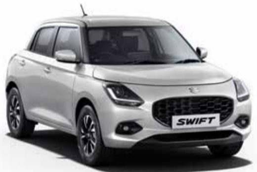
/ Pearl Arctic White