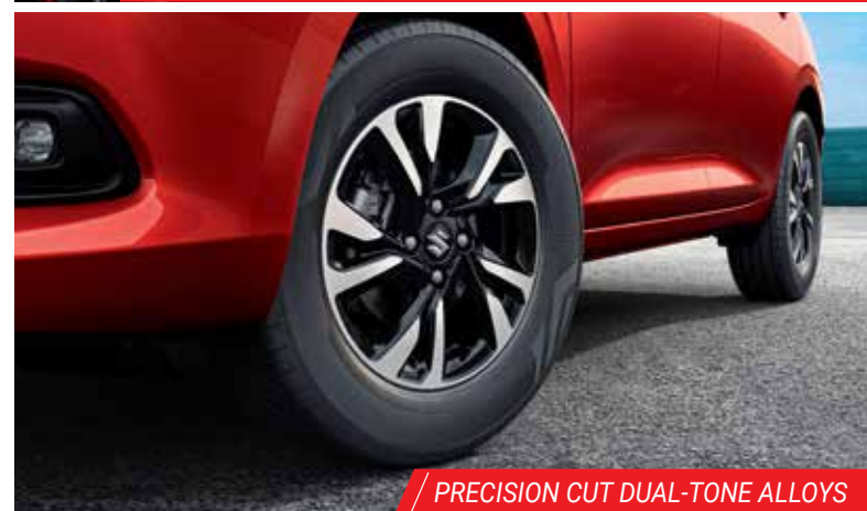
/ PRECISION CUT DUAL-TONE ALLOYS