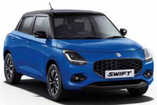
/ Luster Blue with Midnight Black Roof