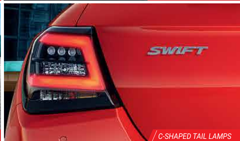
/ C-SHAPED TAIL LAMPS