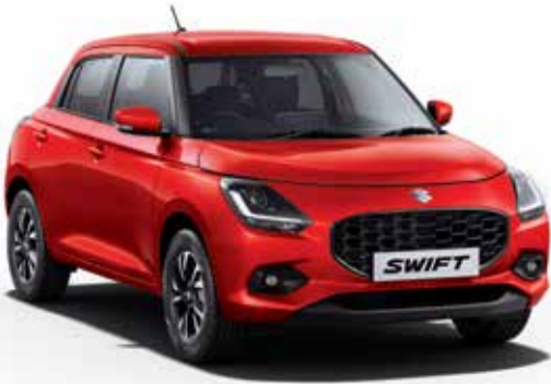
/ Sizzling Red 11