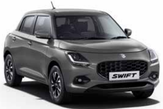
/ Magma Grey