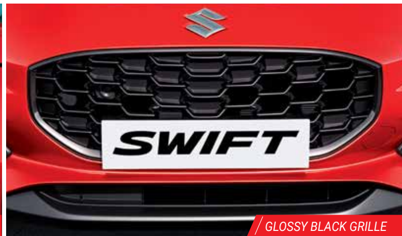
/ GLOSSY BLACK GRILLE