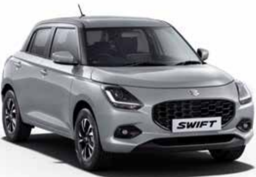
/ Splendid Silver