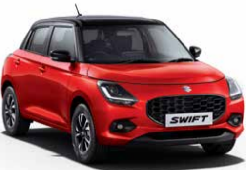
/ Sizzling Red with Midnight Black Roof