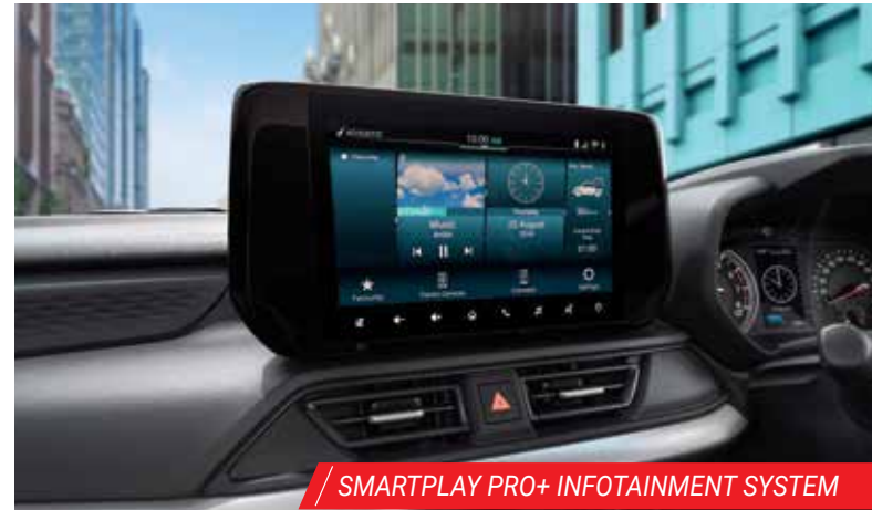
SMARTPLAY PRO+ INFOTAINMENT SYSTEM

No words can describe what you'll feel when you enter the Epic New Swift. But we'll try. This car is designed with ample space keeping your comfort in mind and its Sporty All-Black Interiors make every drive truly stylish. The real head-turner is the sleek and futuristic center console, with a driver-oriented cockpit for easy access.