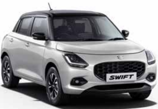
/ Pearl Arctic White with Midnight Black Roof