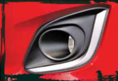
FOG LAMP BEZEL (SILVER ACCENT)