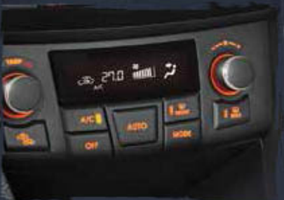
AUTOMATIC CLIMATE CONTROL