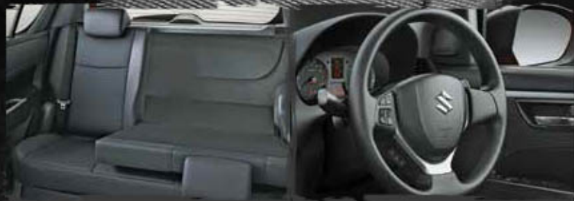
60:40 SPLIT SEATS