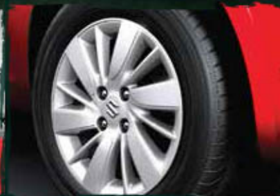
185/65 R15 ALLOY WHEELS