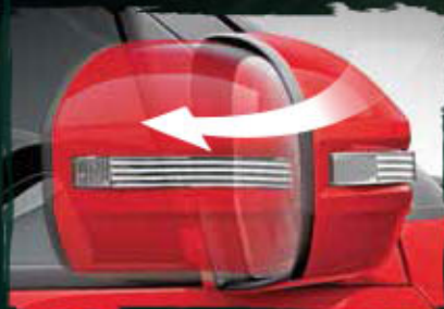
ELECTRONICALLY RETRACTABLE ORVM WITH TURN INDICATORS