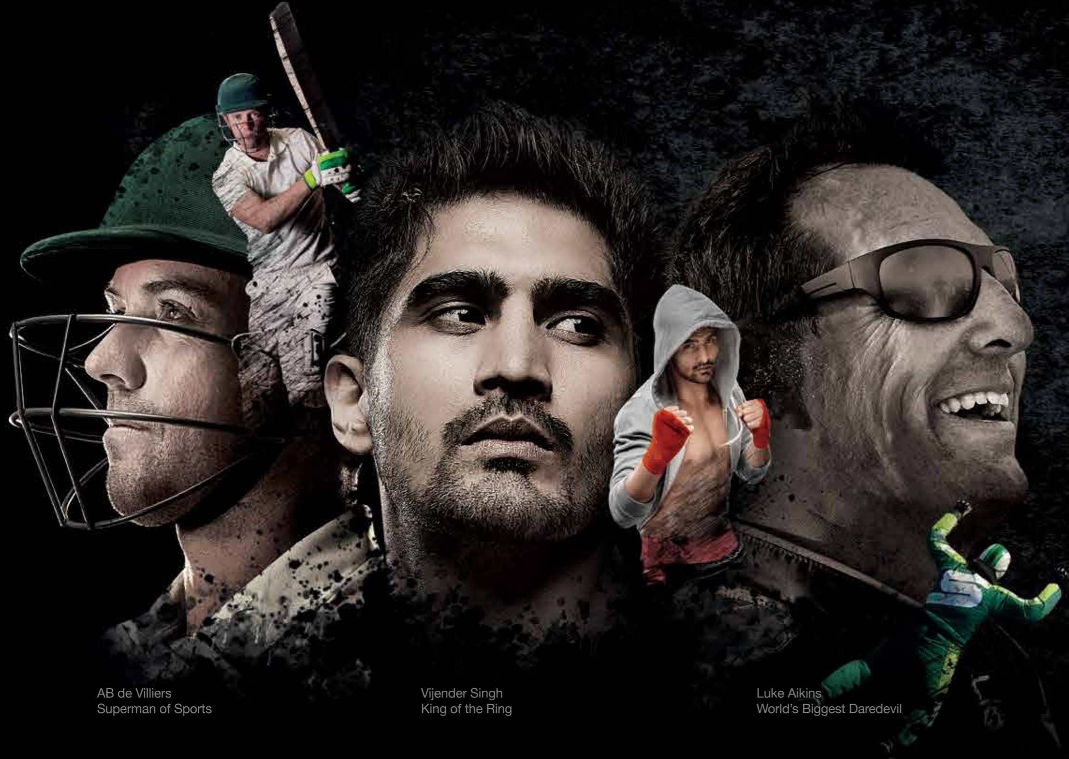
AB de Villiers Superman of Sports