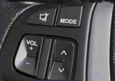
STEERING-MOUNTED AUDIO CONTROLS