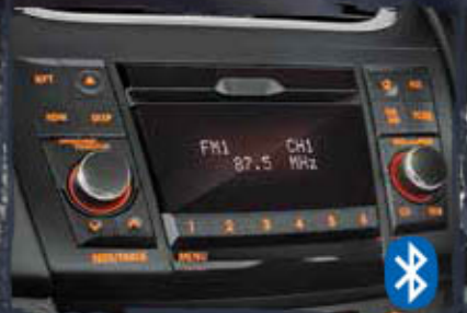
AUDIO SYSTEM WITH BLUETOOTH