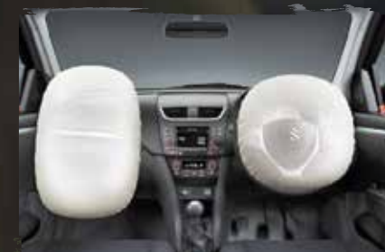
DUAL SRS AIR BAGS