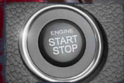
PUSH START BUTTON