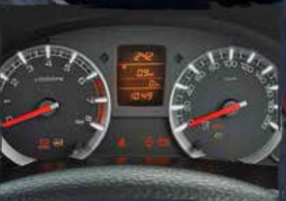
INSTRUMENT PANEL WITH MULTI-INFORMATION DISPLAY