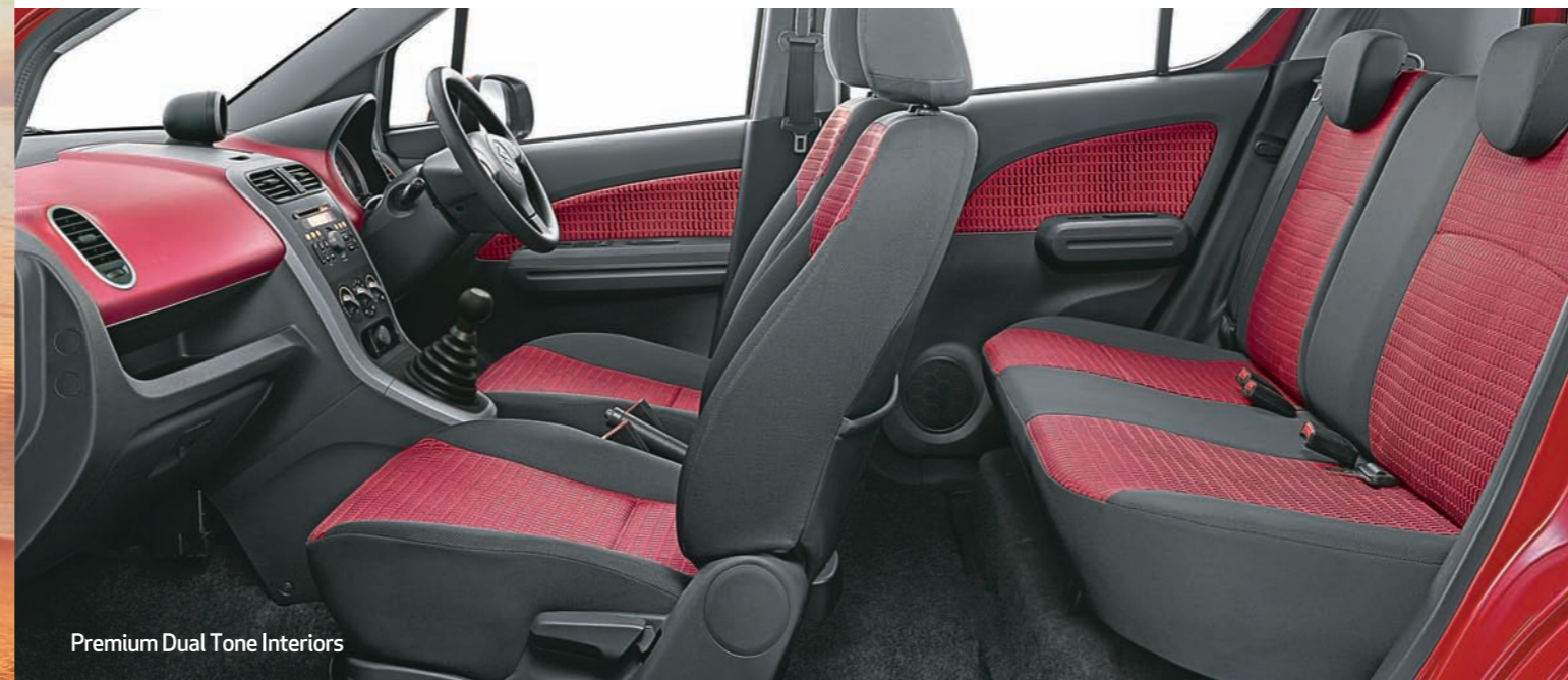
Premium Dual Tone Interiors