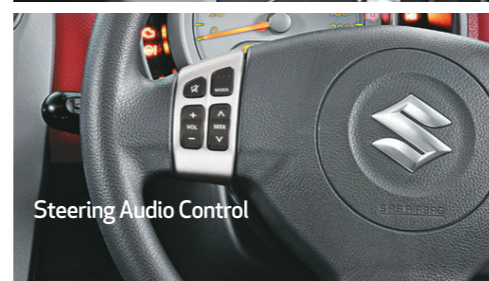
Steering Audio Control