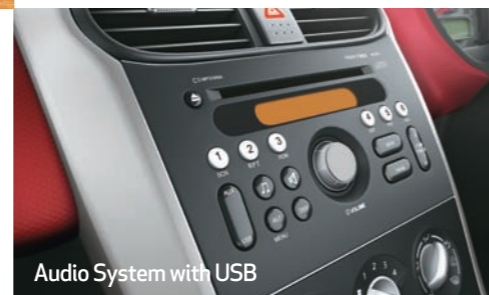
Audio System with USB