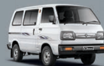
OMNI 5 SEATER