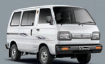
OMNI E 8 SEATER