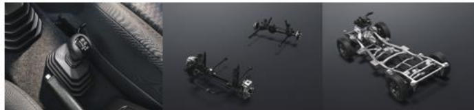
ALLGRIP PRO (4WD)