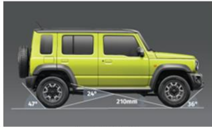
Ample Body Angles