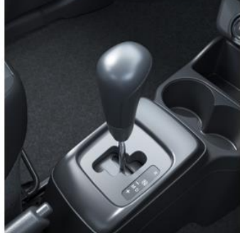
Excellent fuel-efficiency# of up to 24.90km/l with Auto Gear Shift

transmission options. The AGS transmission in the All-New Alto K10 offers enhanced driving comfort and convenience to consumers.