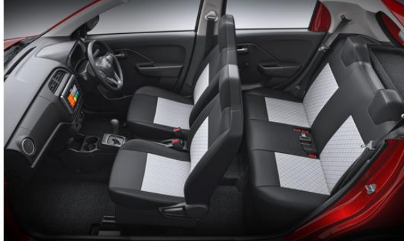
Ergonomically designed, lively & spacious interiors with center focused dashboard design, floating audio unit and premium accentuation