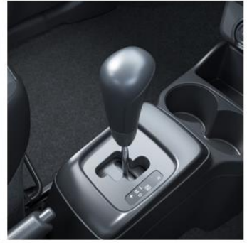
Excellent fuel-efficiency# of up to 24.90km/l with Auto Gear Shift

transmission options. The AGS transmission in the All-New Alto K10 offers enhanced driving comfort and convenience to consumers.