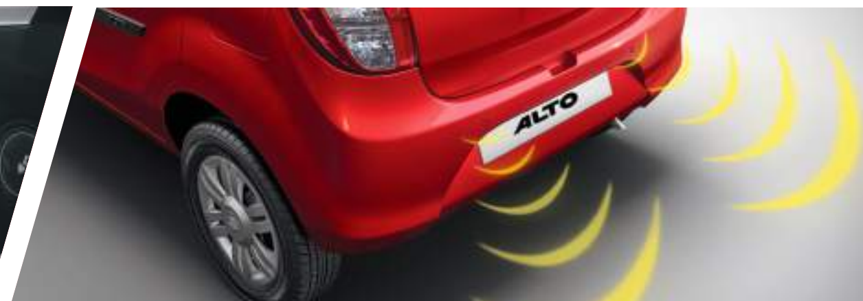
Smart Reverse Parking Sensors