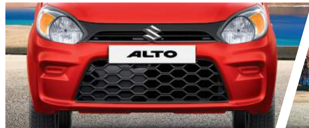
Dynamic New Aero Edge Design

The elegant new design lends a fresh appeal to the Alto, while also accentuating its distinct looks.