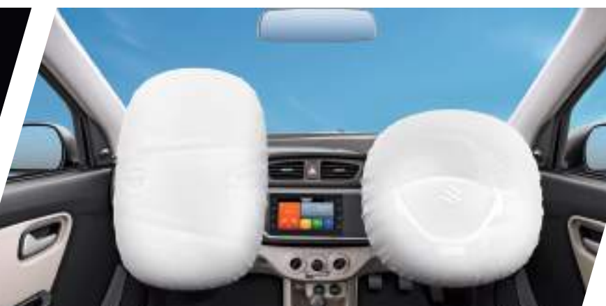
Dual Airbags for Added Safety