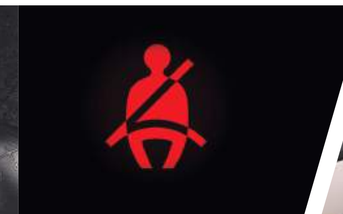
Driver + Co-driver Seat Belt Reminder