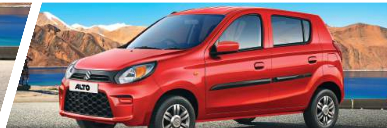
Bumper and Side Fender