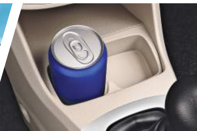
Front and Rear Console Bottle Holder