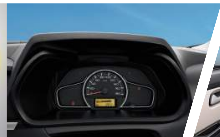
New Speedometer Design