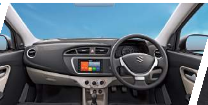
Elegant New Dual Tone Dashboard