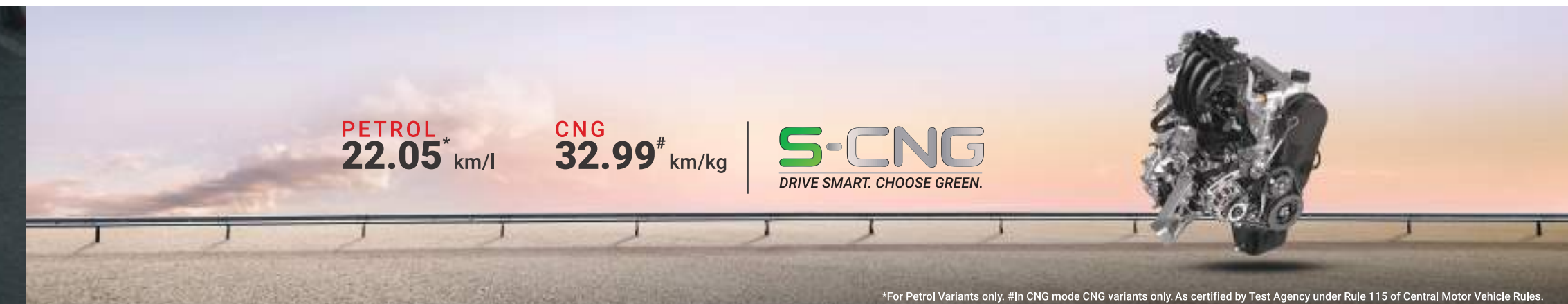
Powerful and Fuel Efficient Engine

The new Alto, with its peppy engine and the Factory-Fitted S-CNG Technology ensures that you get the most out of your drives.