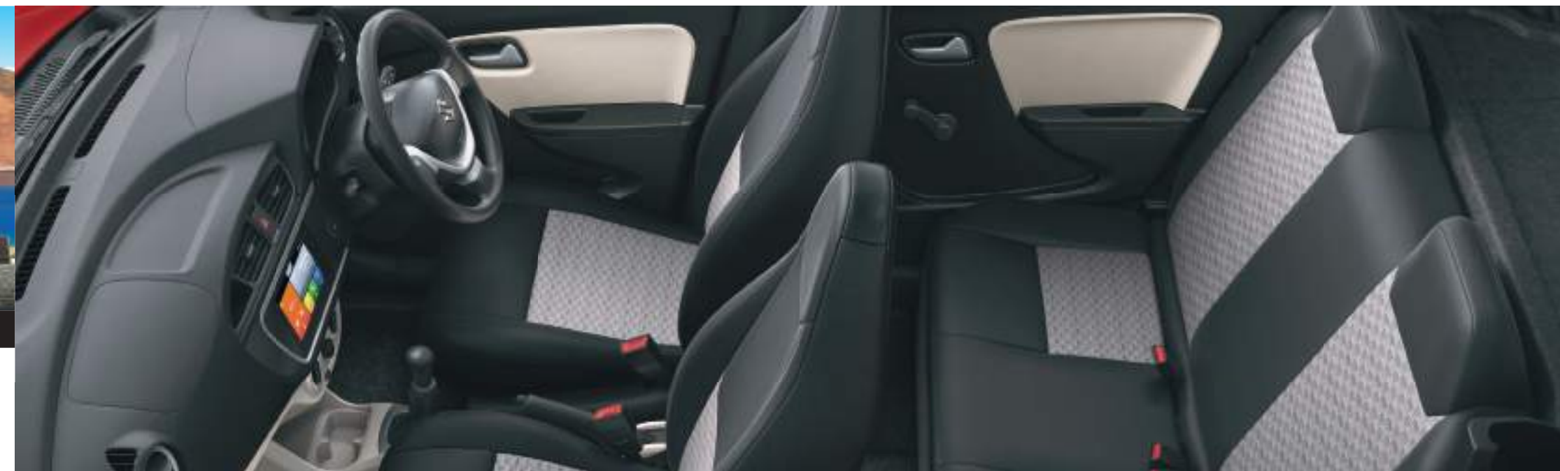
Stylish Dual Tone Interiors

A perfect blend of style and practicality, new Alto's upgraded interiors make it a universal favourite.