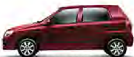
FIRE BRICK RED*